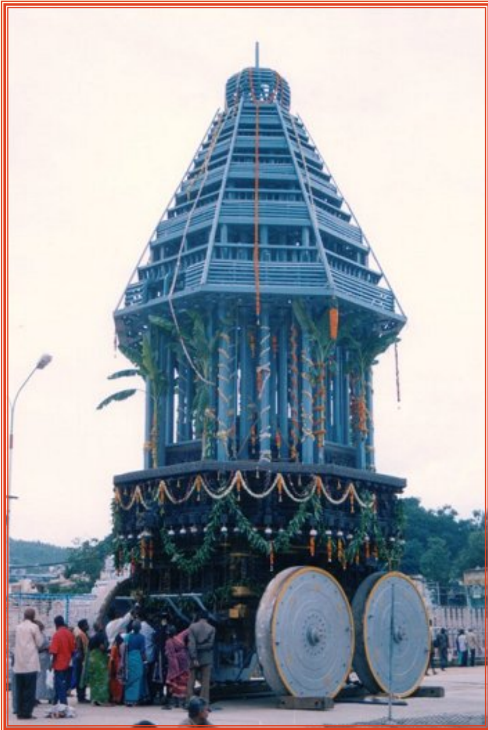
Thirupathi kOil thEr