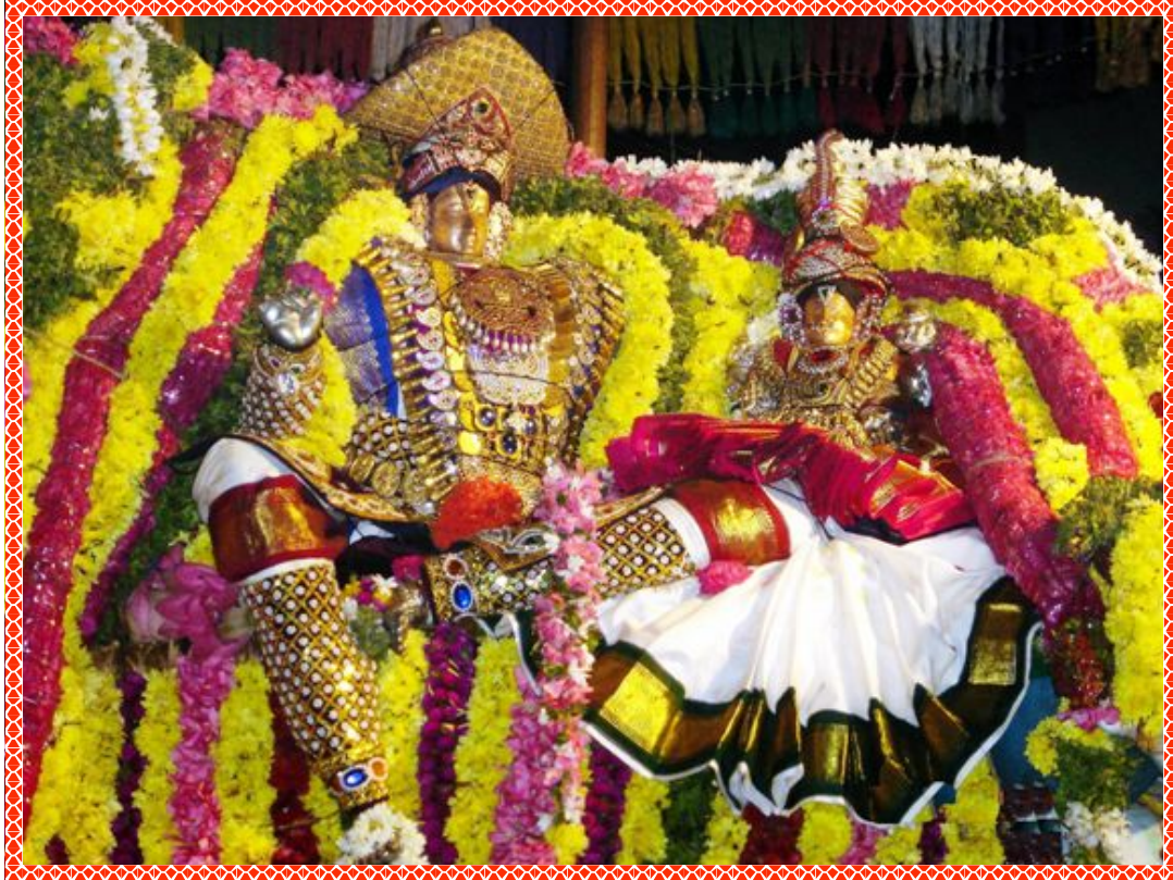
Thiru SARangapANI and KomaLavalli thAyAr--Thirukkudanthai